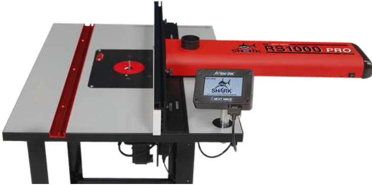
Table Template Instructions

Please follow these simple instructions to successfully prepare your router table for Next Wave CNC RS1000 PRO.